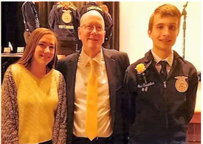
Roberta Ann Scholarship Winners