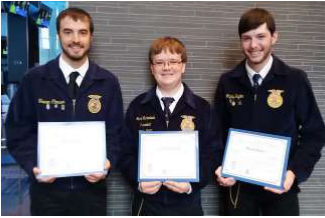
American Degree Winners