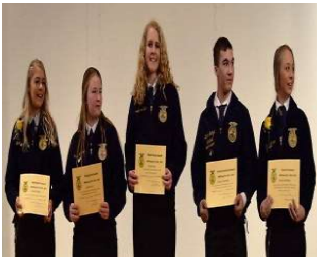
Chapter Dedication Award Winners