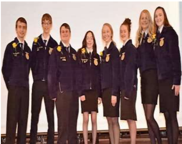
Retiring Officer Team