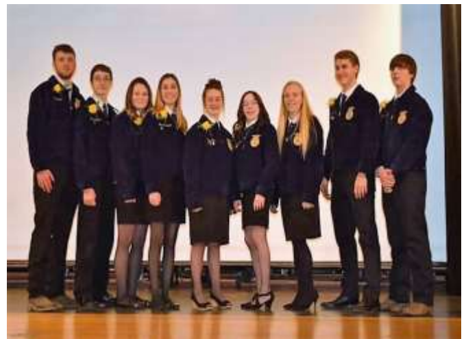
New Officer Team