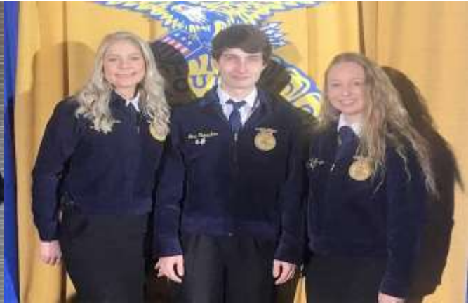
Keystone Degree Winners